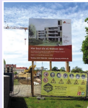
Display of sanctioned drawings (preferably elevation) at Construction Site