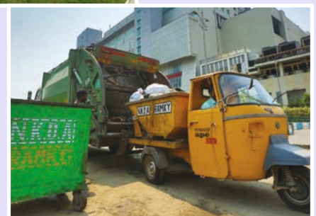
NKDA paid service for disposal of C&D waste