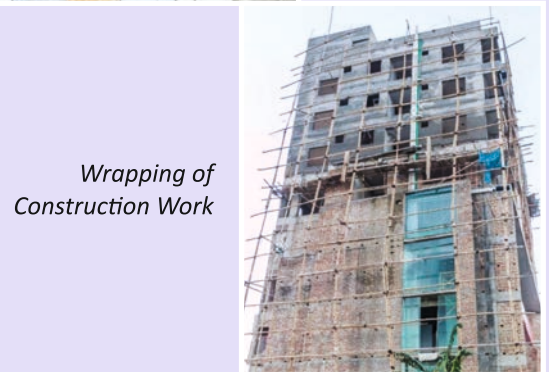
Wrapping of Construction Work