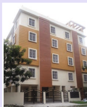
Photographs of site and surroundings to be submitted at the time of OC/POC