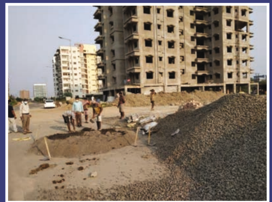
Dumping of Construction material on road surface and footpaths by the Promoters of Housing Societies