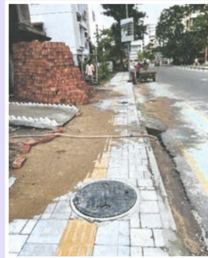
Construction material is stacked after keeping the pedestrian movement uninterrupted