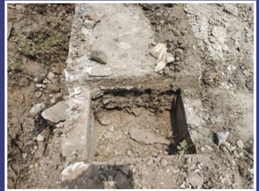
Blockage of Drainage Line due to dumping of Bentonite Slurry and other construction materials